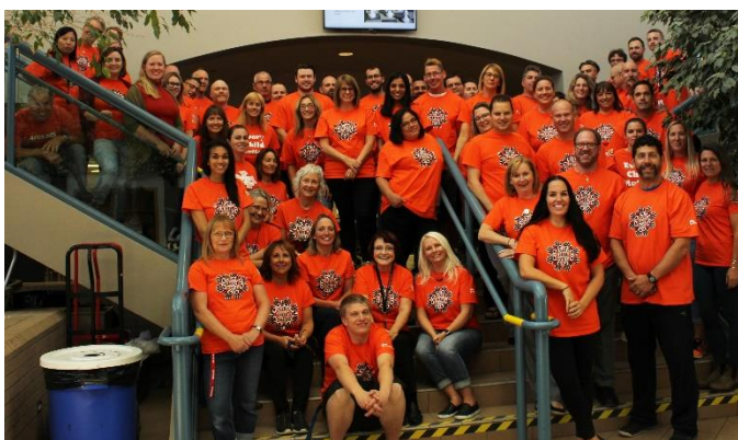
DOVER BAY STAFF AND STUDENTS HONOR ORANGE SHIRT DAY