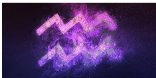
February Zodiac Sign – Aquarius!

Report cards for semester one were issued last week. As of today, 57% of our students have opened up their report cards. We are currently trying to determine how many parents have viewed the reports. Obviously, a great deal of work has gone into creating the report cards and we hope our families are seeing the semester one feedback. Knowing that the MYEDBC Parent Portal can be challenging to log into, here is a link with information which you may find useful: https://dv.schools.sd68.bc.ca/students-and-parents/myedbc-support-documents/