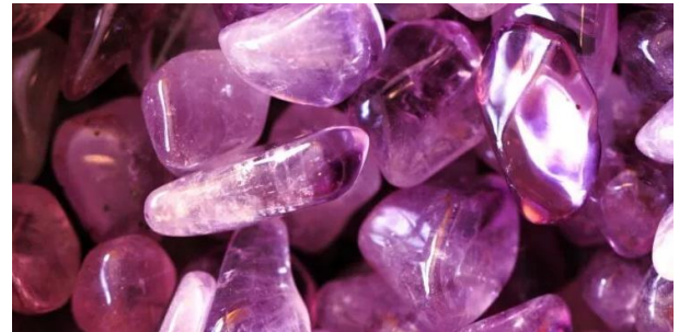
February Birth Stone – Amethyst!